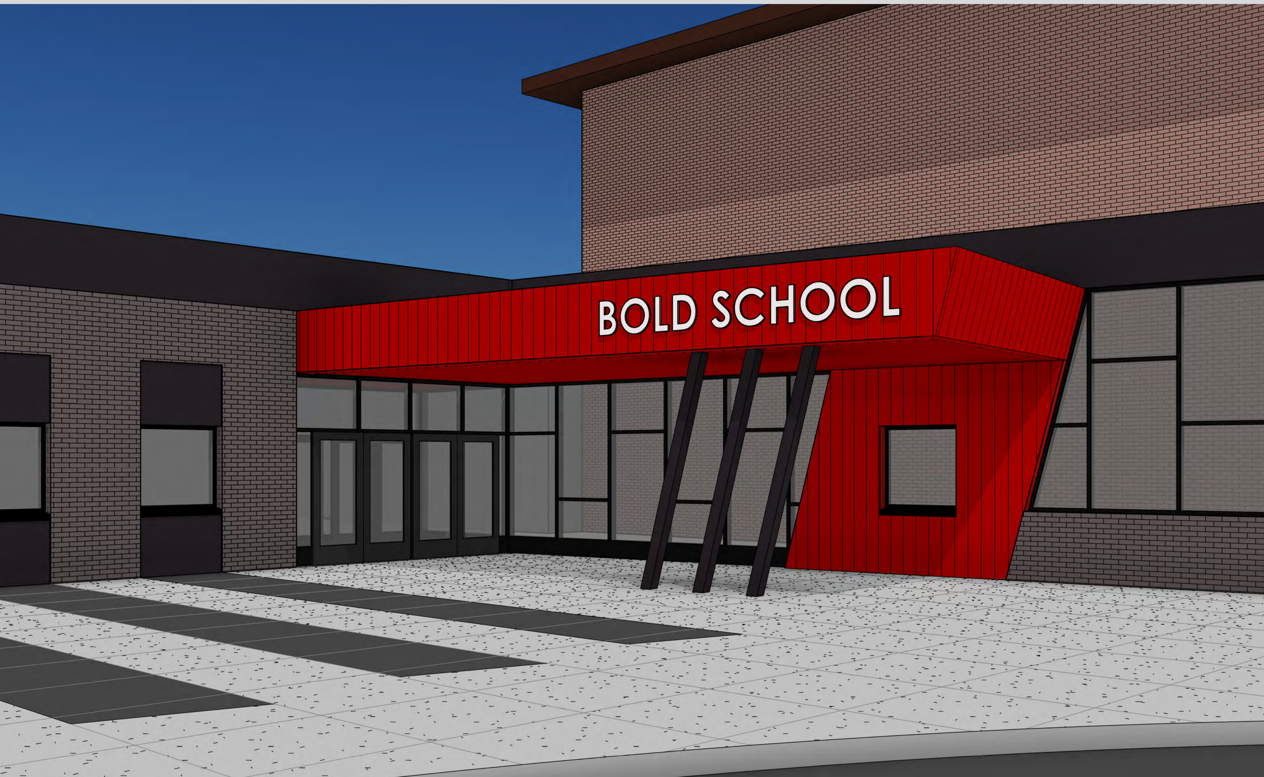
NEW Entrance on East Side with Security Vestibule