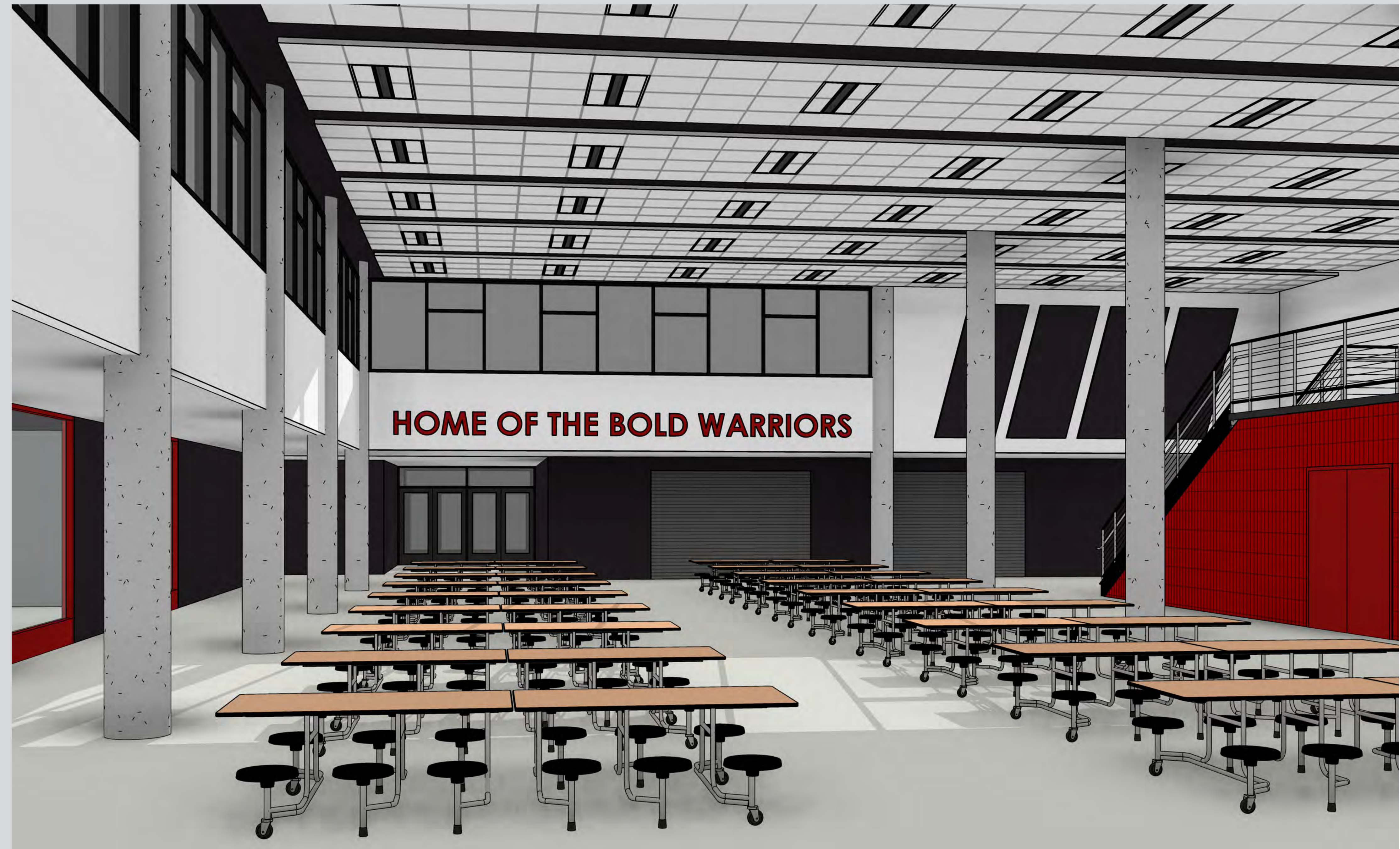
Expanded Cafeteria/Commons Area