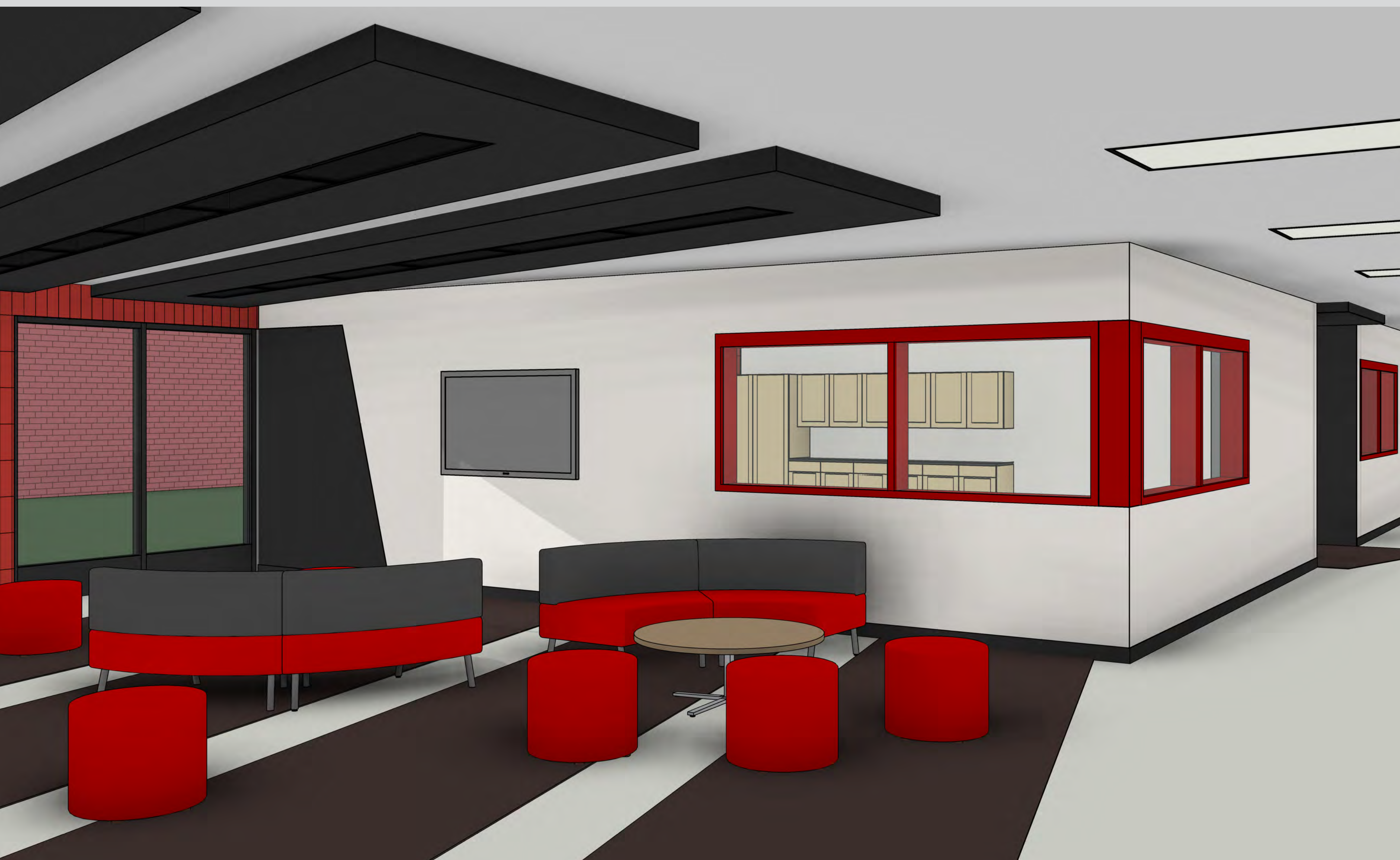
Elementary Breakout Area for Small Group Projects