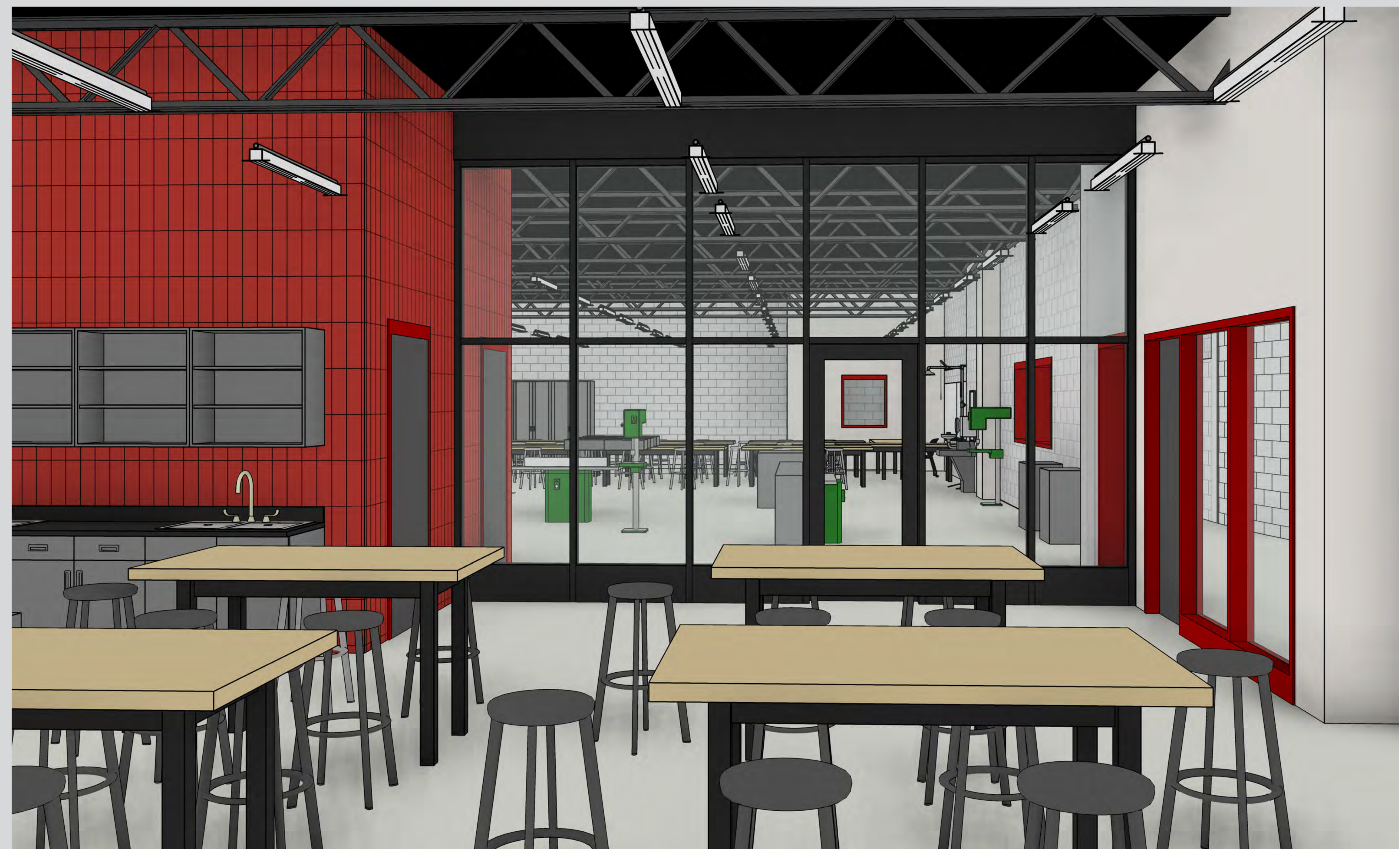
Technical Education Classroom Facing Shop